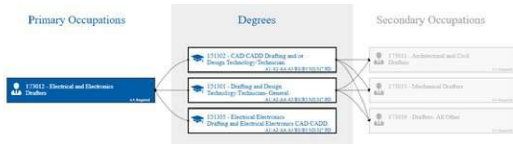
Figure 2: Electrical and Electronics Drafters