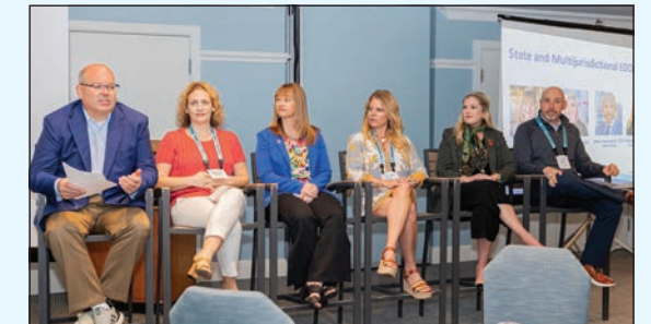
Site Selector's Guild – Winter Summit

Beyond Our Beaches Inbound Mission Economix by Consultant Connect IAMC Fall Forum PoweringFlorida Illumination SEDC Emerging Leaders Conference Site Selector's Guild Events