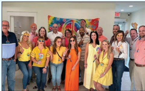
Site Selector Mission in Port St. Joe