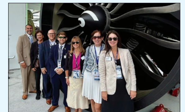
Paris International Air Show