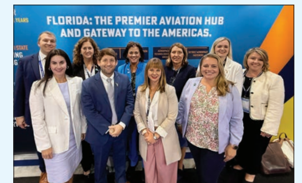
Paris International Air Show

Aviation Forum Hamburg CAMX MRO Americas Paris International Air Show SelectUSA Investment Summit