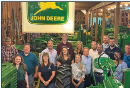
Major Investors Tour